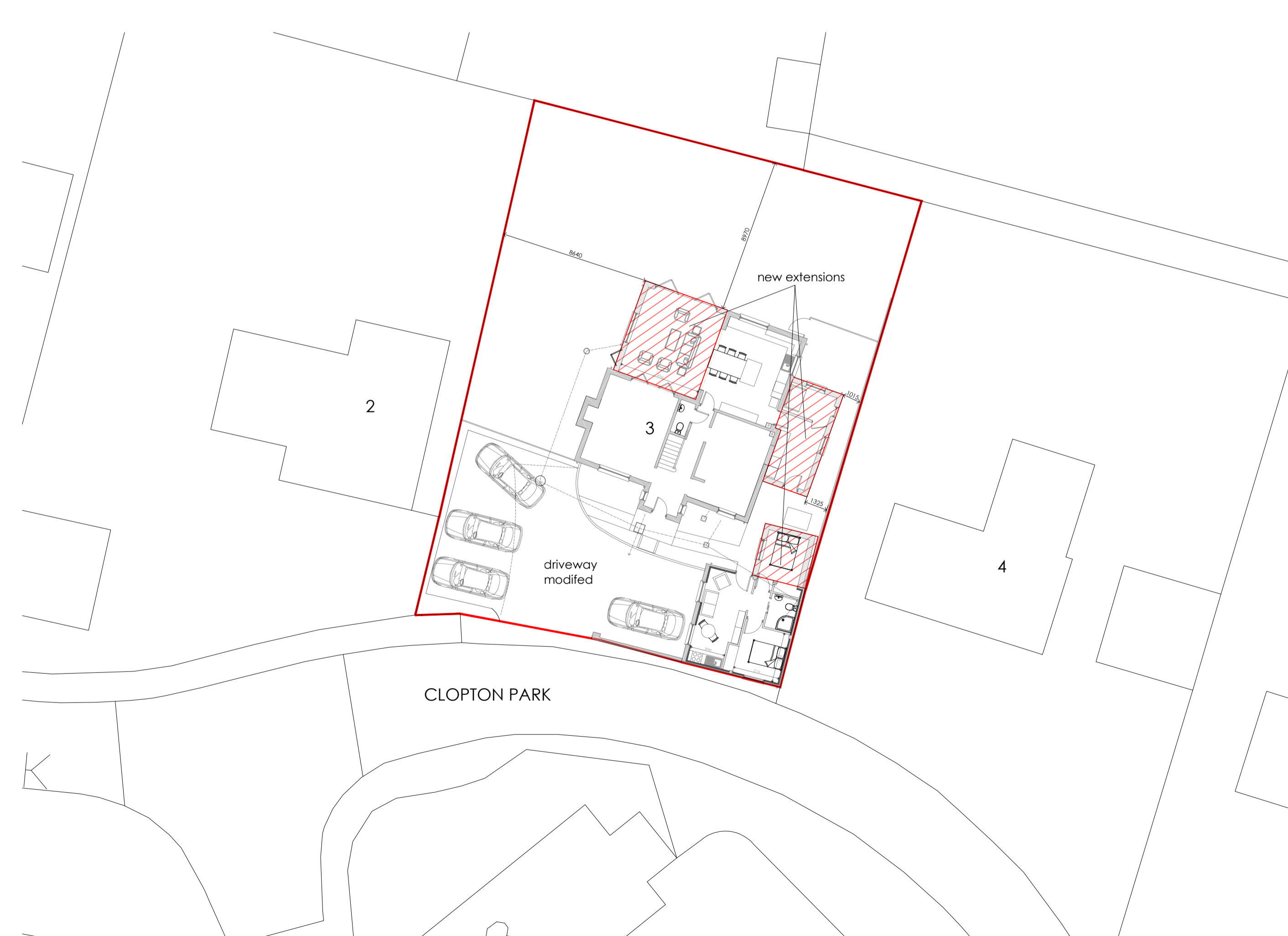
Proposed Site Plan/ Block Plan