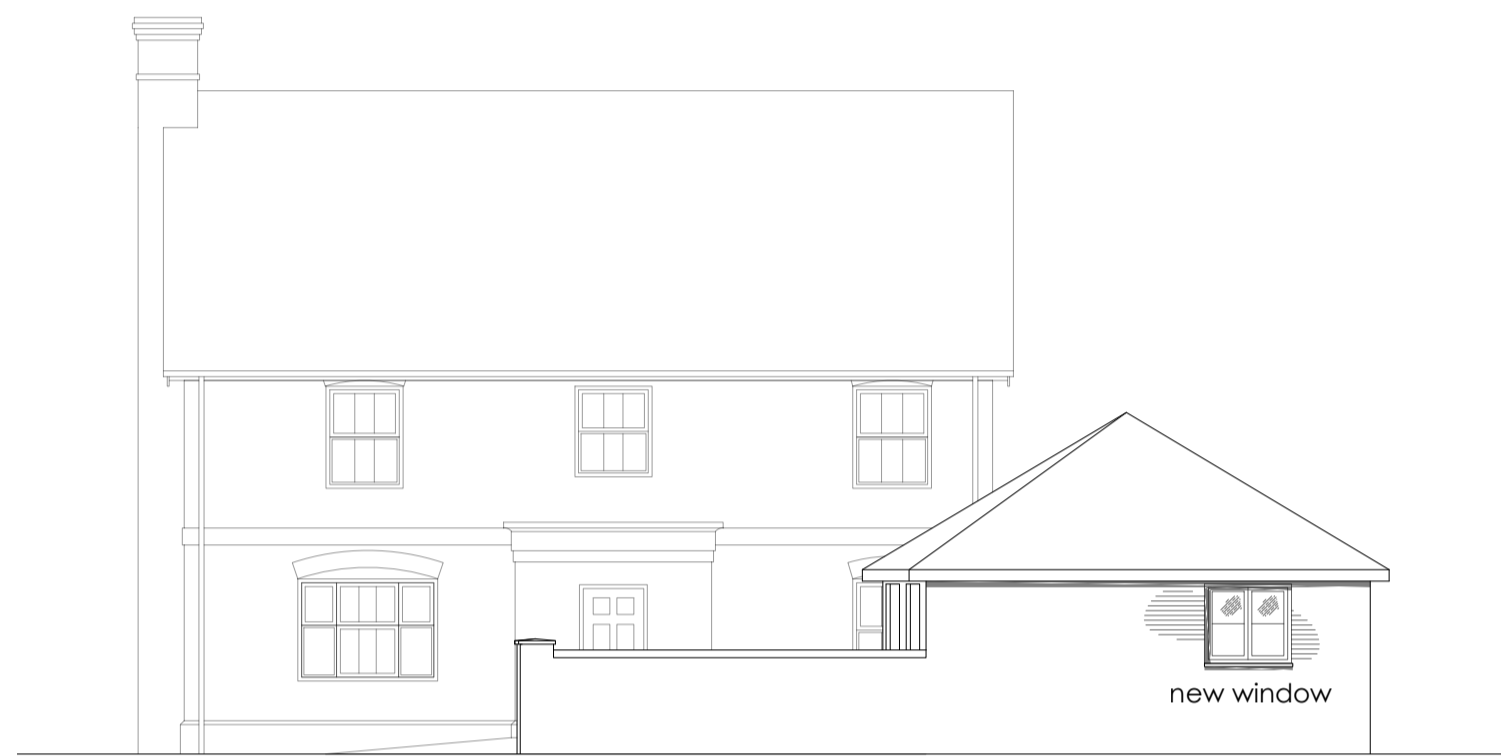
Proposed Street Scene