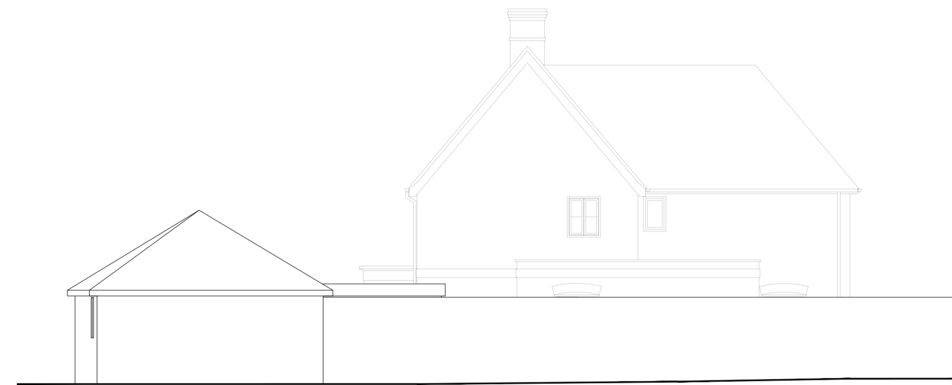
Proposed View From No.4